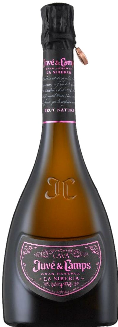
CLOS LA SIBERIA

It is captivating to the eye with its splendid grapefruit colour, its delicate pink reflections and its abundant, tiny bubbles . Then it seduces from the very first moment with its enveloping aroma, evoking freshly picked wild red fruit, with notes of finely toasted almonds and subtle hints of brioche bread, reminiscent of its long ageing . Finally, it dazzles with its firm, creamy structure that floods the palate, its balanced acidity and its accentuated gourmand touches with a mineral undertone that enamours until the last sip, prolonged and extremely elegant .